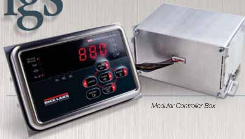
Modular Controller Box

The sleek design of the 880 not only looks great, it also fits great into existing and new panels alike. At just over four inches deep, the efficiently designed enclosure fits easily into compact spaces with built-in DIN-rail clips and pre-drilled holes to make mounting quick and effortless. The 880's modular design enables the display to be mounted up to 250 feet from the controller, useful for instances when it is inconvenient to mount the controller on a conventional panel. And communicating to a PLC independently of a display lends the 880 even greater versatility. The IP69K-rated gasket effectively resists high-pressure washdown and dust, keeping internal components out of harm's way in certain NEMA-required environments. Finally, the enhanced circuit protection is rated for industrial immunity and susceptibility from ESD/RFI/EMI, effectively filtering interference to provide stable weight values.